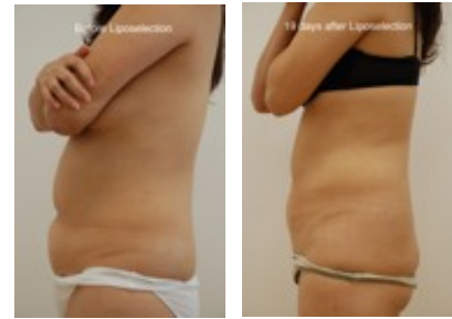
19 days after