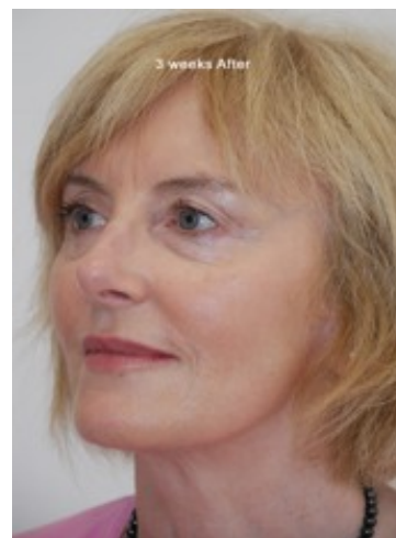
3 weeks after